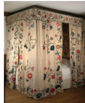
18th-century Bulman bedhangings at the Museums of York.